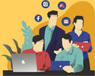
Digital Marketing Agencies

There are two main different ways that a company can market their product. These two ways are in-house marketing and agency marketing. Companies who market their products must make a decision between these two options to decide who they will use to market their product.