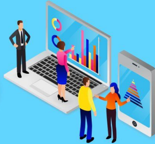
In-House Marketing Teams